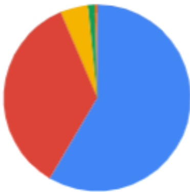
Count of [The training met my expectations.]